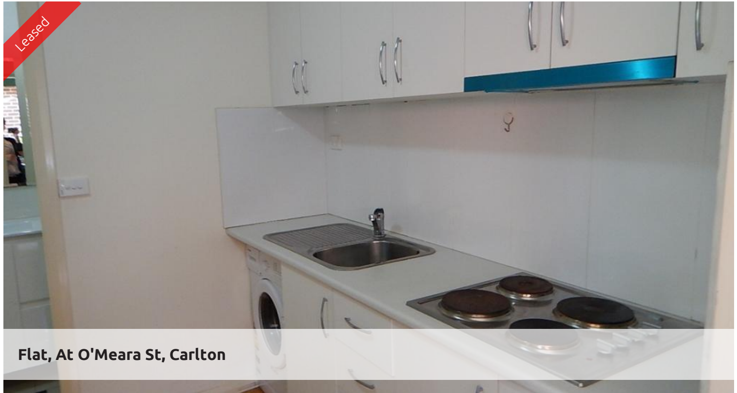
Flat, At O'Meara St, Carlton