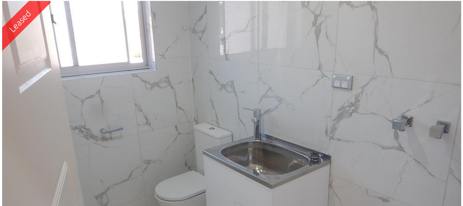
First Floor, At William Rd, Riverwood