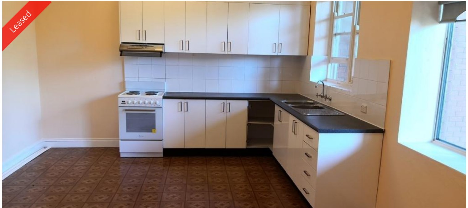
Flat, At Australia St, Hurstville