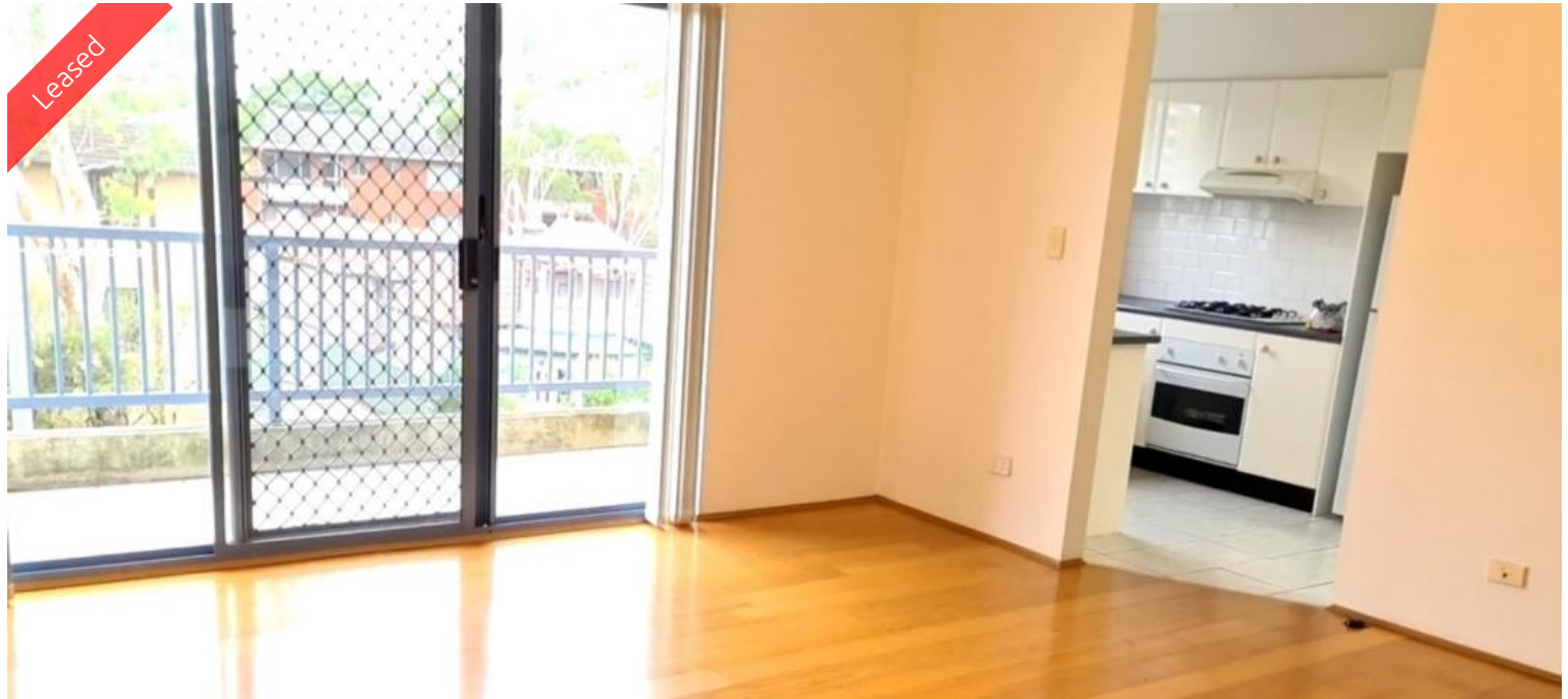
Unit At, 1 Hillcrest Ave, Hurstville