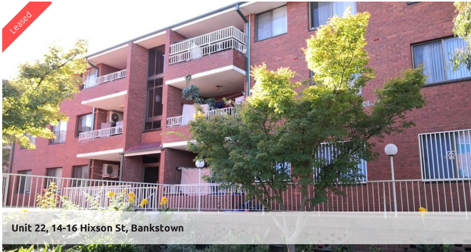
Unit 22, 14-16 Hixson St, Bankstown